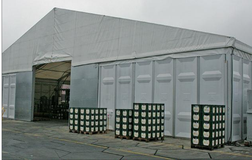
A complete sorting plant with palletiser and unpalletiser for bottles and a packer for external bottles needs a tent with the dimensions of 15 x 25 meter

Two independently working plans were installed at Bitburg in a 30 x