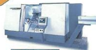
DMG CTX 620 linear