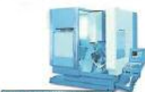
DMU 70 Evolution