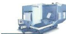
DMO 125 P HI DYN